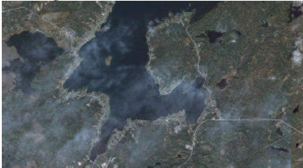
Satellite Image of the area.